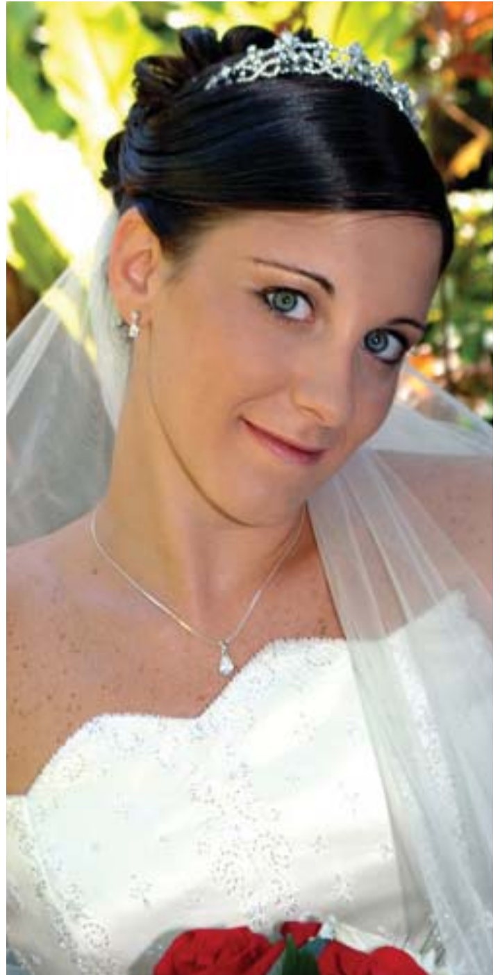
Flowers & makeup are for idea only and may not represent what is supplied.